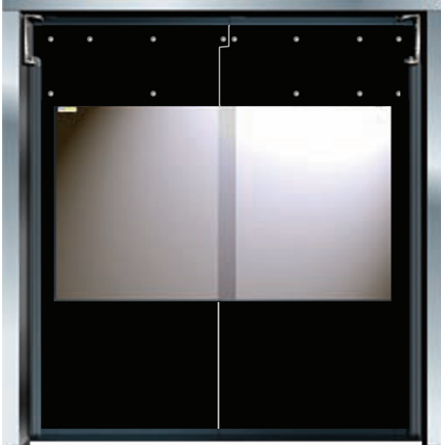
Model 2600 shown