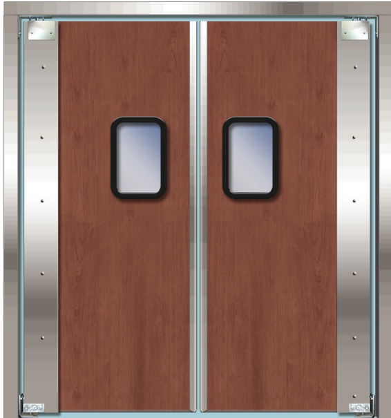
Model 5000HPL with reinforced spine.