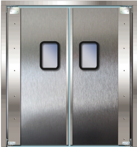
Model 5000SS with reinforced spine.