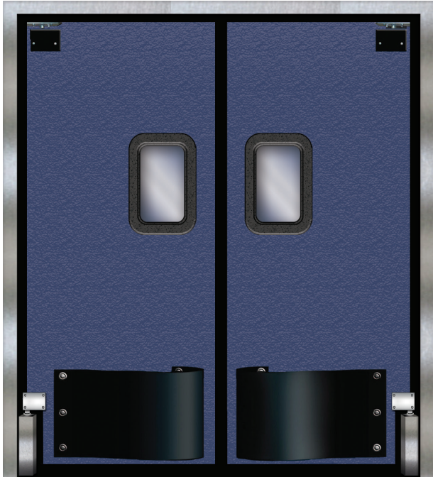
Model 8000 shown with optional 18" teardrop bumpers.