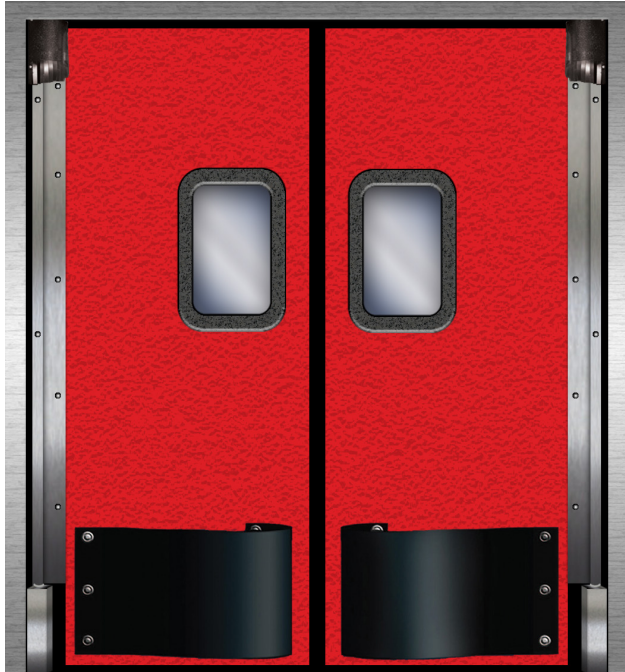
8500 shown with optional teardrop bumpers.