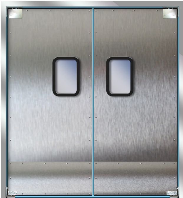
9000SS shown with optional 12" impact plates.