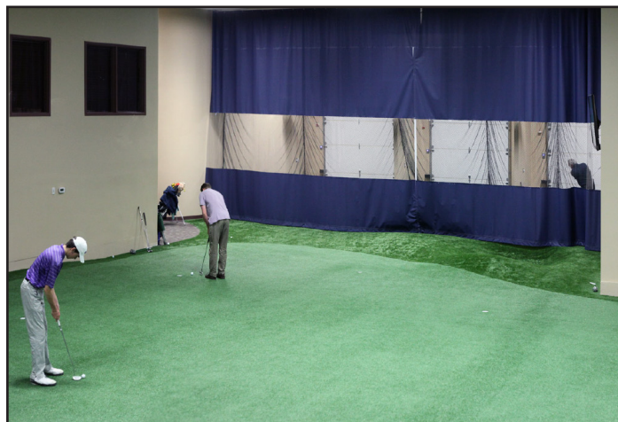
National Access Design curtain installation at Maketewah Country Club, Cincinnati, Ohio.

NOTE: When ordering stationary unit specify how many walls are needed and if a ceiling is required. Standard wall sizes are; 10' wide x 8' high and 10' wide x 10' high. Other sizes are available.