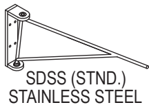
SDSS (STND.) STAINLESS STEEL

Doors to be constructed from a base layer of .160 Clear P.V.C. Standard features are: • Top mounted gravity hinges. • Full Perimeter Seal. • Reinforced Leading Edge. • Not for freezers.