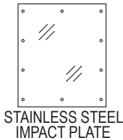
STAINLESS STEEL IMPACT PLATE